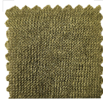
SHOW Nm. 2/36 100% Linen