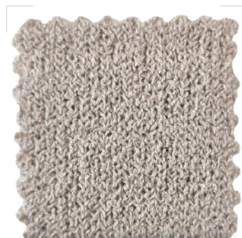
CURL Nm. 1/9 80% Cotton / 20% Polyamide