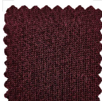
CORRECT Nm. 1/28 55% Cotton / 45% Viscose