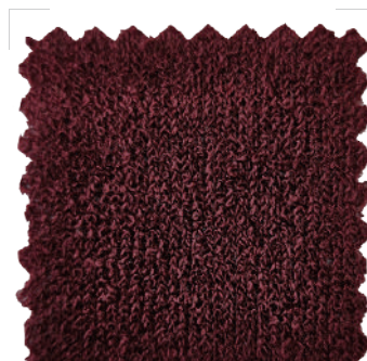
CARA Nm. 1/22 80% Cotton / 20% Polyamide