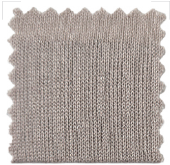
CLEVER Nm. 1/55 55% Cotton / 45% Acetate