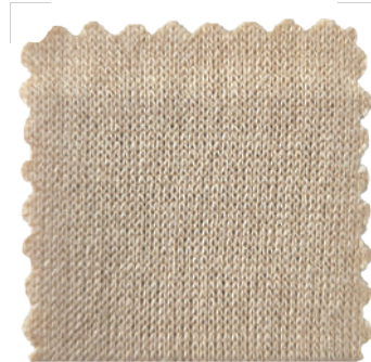
DIMPLE Nm. 2/60, 2/48 90% Cotton / 10% Cashmere