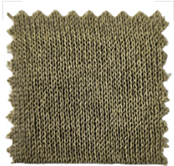
NATURE Nm. 1/24 65% Hanji(Paper) / 35% Polyamide