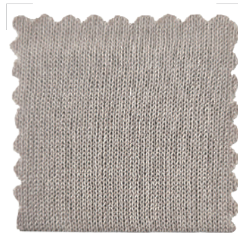
COOLDRY Nm. 1/55 55% Cotton/45% Polyester