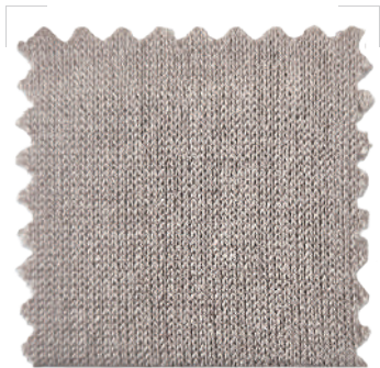
SAGE Nm. 2/60 80% Cotton / 20% Silk