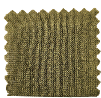
ELCANTO Nm.1/27 75% Linen / 25% Cotton