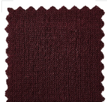
CALL Nm. 4/100 100% Cotton(Dry touch)