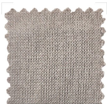
FORTE Nm. 2/48 70% Cotton / 20% Polyamide/ 10% Silk