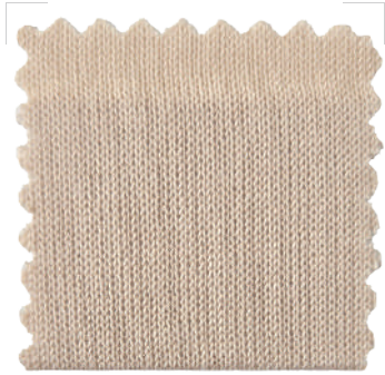
CREATION Nm. 3/100 100% Cotton