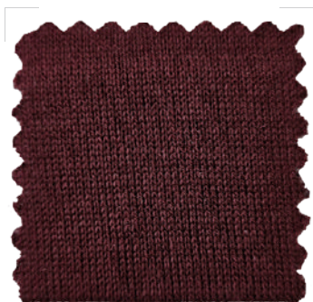
SEED Nm. 2/50 100% Cotton