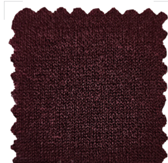
LIME Nm. 1/55 55% Cotton / 45% Viscose