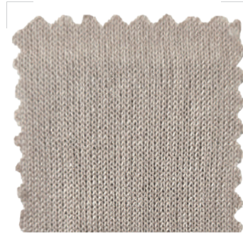
CAPTAIN Nm. 1/28 80% Cotton / 20% Polyamide