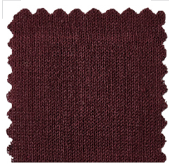
LEADER Nm. 6/170 100% Cotton(Dry touch)